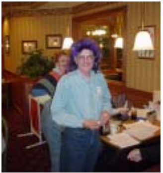
Now THAT’S Scary !!

An excellent turn-out of rallyists thoroughly enjoyed the atmosphere, what a night for a scary rally.