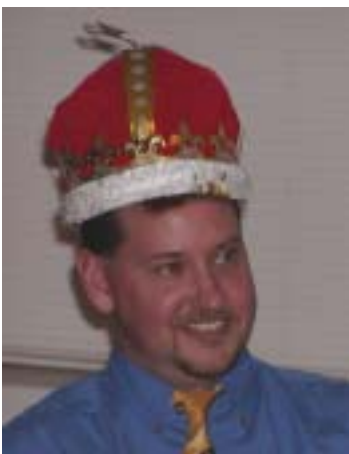
Rookie Of The Year