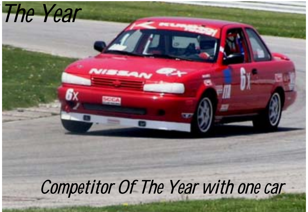
Competitor Of The Year with one car