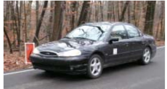
Map Rally March 19 "In Search Of ....."