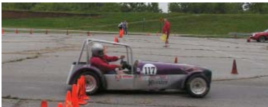
& Overall Winner

Go faster with our series associate sponsor Advance Import Motorsports! www.aimtuning.com 317-381-0898