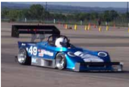
Clemens Burger - 2nd B Mod