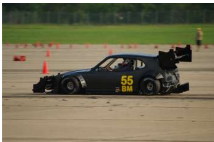
Very cool looking B Mod car. All carbon fiber body.