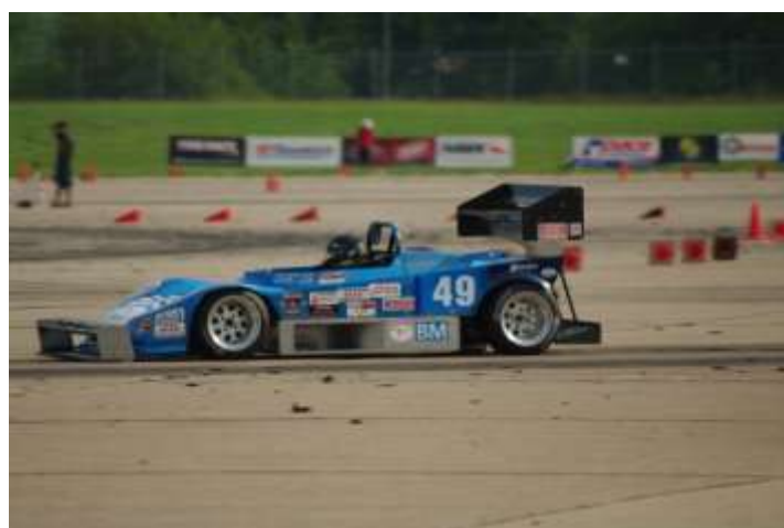
Dan Stone - B Modified