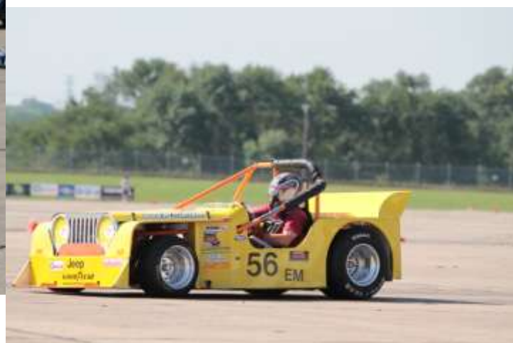
Who said Jeeps aren't fast?